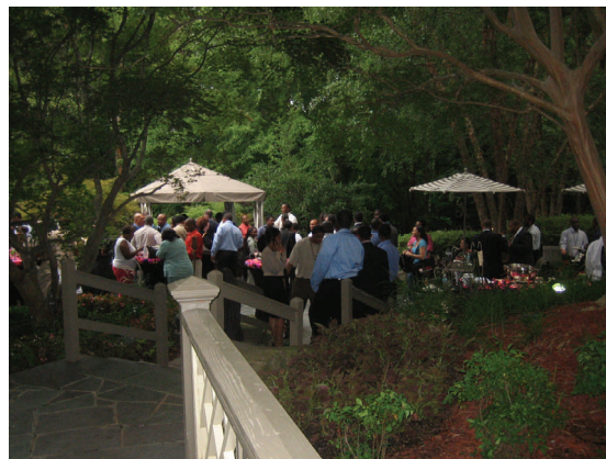
Networking Reception in Ravinia Gardens, sponsored by DW Simpson & Company

Saturday morning started bright and early at 7:45am with a Breakfast, sponsored by Ernst & Young LLP, after which, participants again had the opportunity to attend learning sessions. One notable session on Friday was "The American Pension Plan: From Capitol Hill to the Board Room." What made this presentation especially interesting was the fact that new, pension reform legislation had just been passed the previous evening in Washington, D.C. This presentation was the first glance that many of