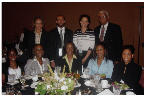
One of the tables at the Awards Dinner

For those in attendance the conference was a wonderful opportunity to learn, to grow and to network. A wealth of information and knowledge was imparted over the course of the weekend. As IABA continues to "Lead Change" throughout the industry, we also continue to recognize that the members of IABA are what make it the wonderful organization that it has become. We look forward to seeing everyone at the 14th Annual Conference, slated to take place in Chicago, Illinois. Keep watching for more information to come soon. □