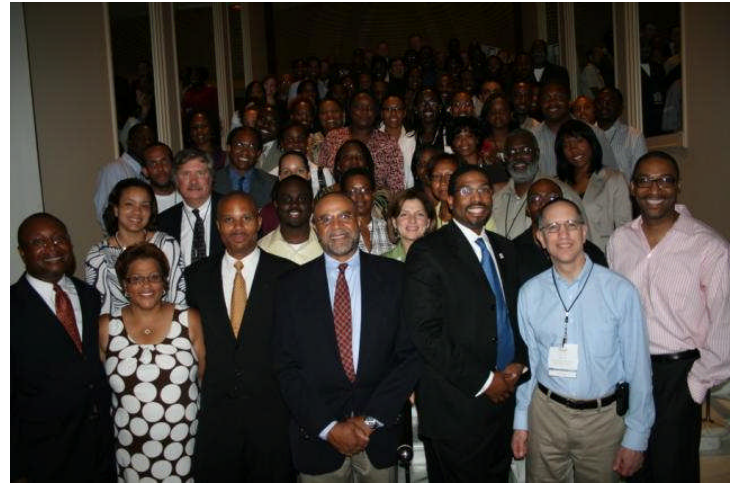
2008 Annual Meeting Attendees

Next year's Annual Meeting will be held in Philadelphia, PA from July 31st to August 1st. As usual, the meeting will be preceded by a meeting of our Corporate Advisory Council on July 30th, and followed by a Leadership meeting on August 2nd. The organizing committee will be looking for ways to enhance the value of our professional development sessions to all attendees. We hope to see you there!