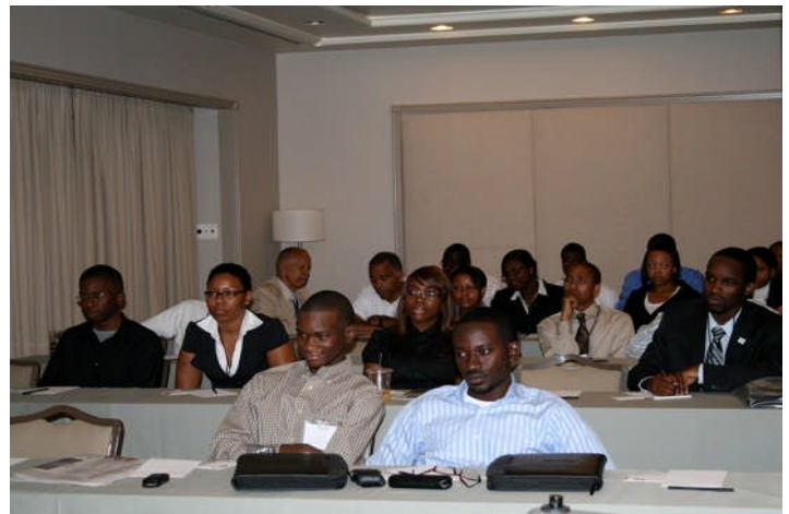
Student Session at 2008 Annual Meeting