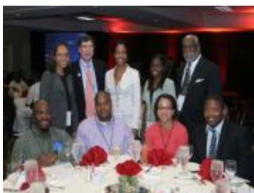
One of the tables at the Awards Dinner

The August 2007 IABA convention was a very positive experience. As an individual who is still making the transition into an actuary career, I found the conference a beneficial introduction to the field, as well as providing valuable resources. These resources include, but are not limited to, professional