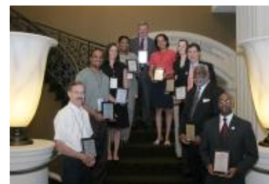
IABA's corporate sponsors being honored at the annual meeting.