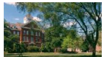
Spelman Campus in Atlanta, GA

After the presentation, a Q&A session was held that generated a lot of good questions and discussion. This event undoubtedly moves IABA in the right direction as we seek to develop a formal partnership with Spelman College and increase awareness of the profession.